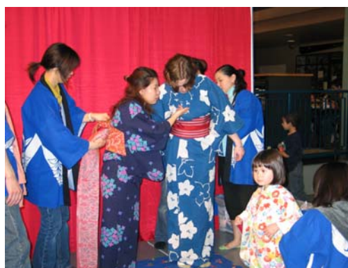
Volunteers dress visitors at this year's kimono-yukata dress-up booth